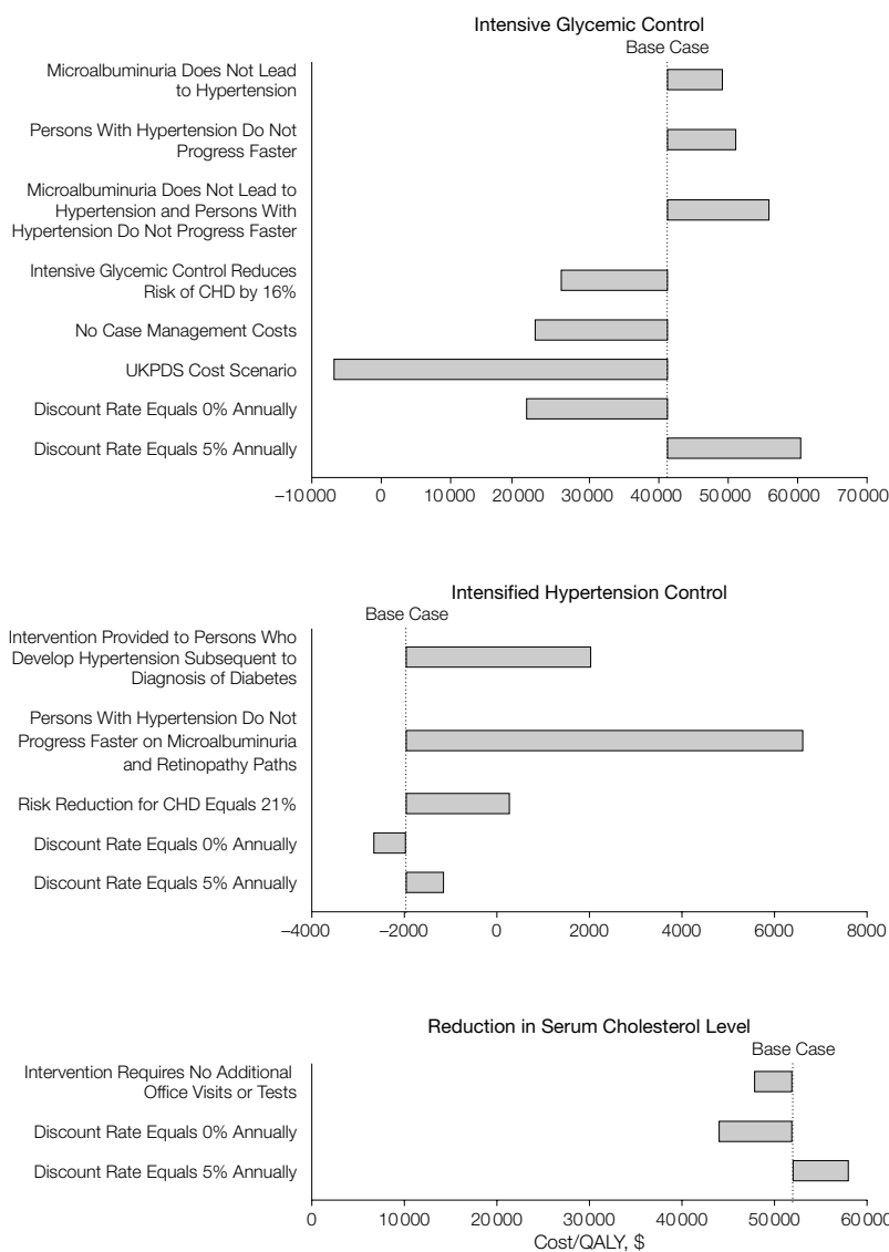
Figure 3. Sensitivity Analyses

QALY indicates quality-adjusted life-year; CHD, coronary heart disease; and UKPDS, United Kingdom Prospective Diabetes Study.